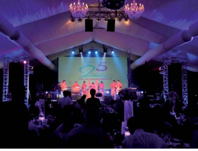
Laguna Phuket 25th Anniversary Gala Dinner on 24 August 2012