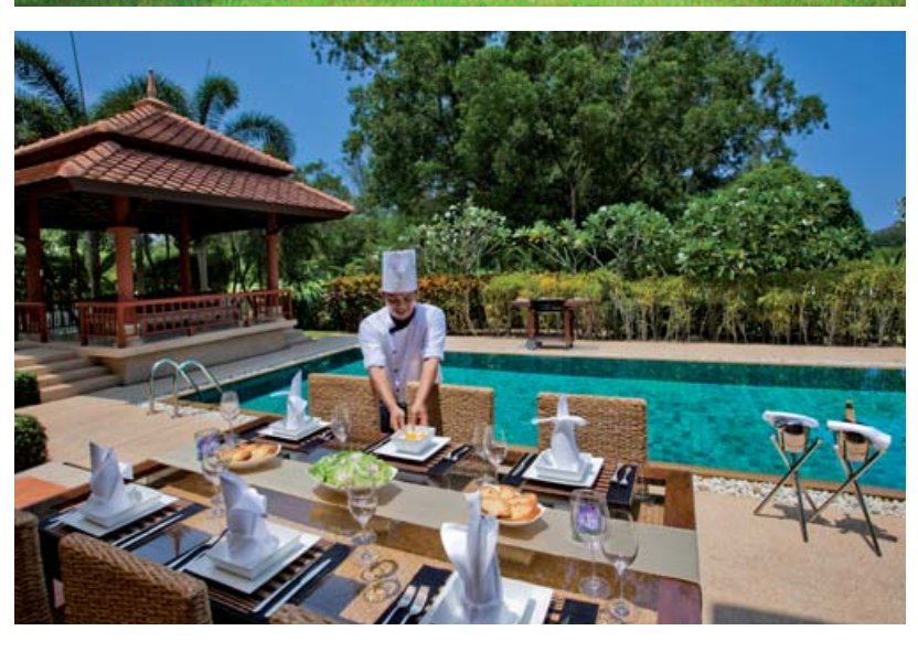
Angsana Laguna Phuket